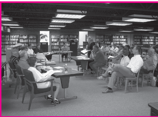
Jefferson Board of Education members receive the report of the High School Facilities Task Force at their June 11 meeting.

As part of their extensive research and review process, the HSFT closely evaluated the current High School and then considered six different facility improvement options. These options varied from extensive remodeling, to remodeling with additions, to constructing a new school on the new site within the school district. The preliminary cost estimates associated with these options ranged from approximately $19 million to more than $49 million.